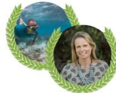
Order of Australia Medals