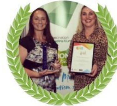
Wolgan Valley Eco Tours win Ecotourism Gold Award