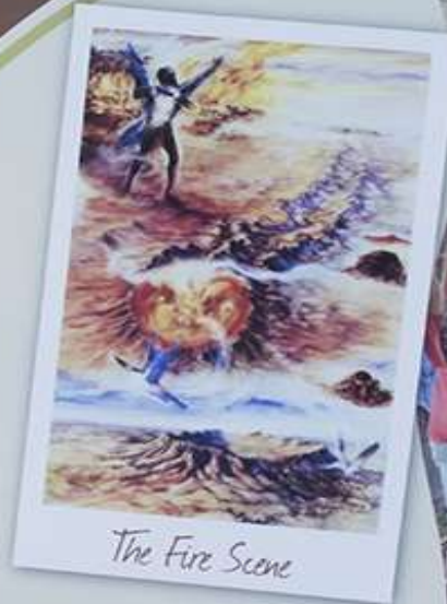
The Fire Scene

We trust your time here on our Yarta will be enriched with the spirit of the land and our people.